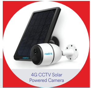
4G CCTV Solar Powered Camera

What do I get? Depending on the findings of the risk assessment, your home could be fitted with security improvements including upgraded window and door locks, external security lighting and window alarms, Wi-Fi/4G CCTV and video doorbells, and repairs to doors, windows and fencing/gates if this would help to improve overall security.