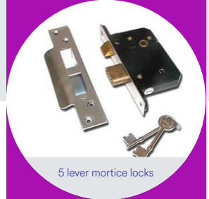
5 lever mortice locks