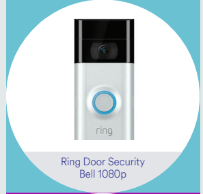
Ring Door Security Bell 1080p