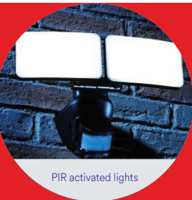
PIR activated lights