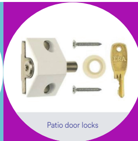
Patio door locks