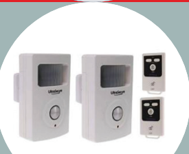
Wireless shed and garage alarm Two room 3G ULTRAPIR GSM Alarm